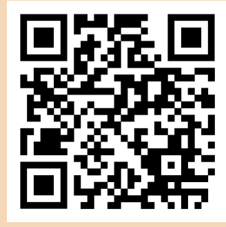
Window Washer I

No pre-registration required to attend. Applicants seen on a first come, first served basis. Bring your ID to apply in person.